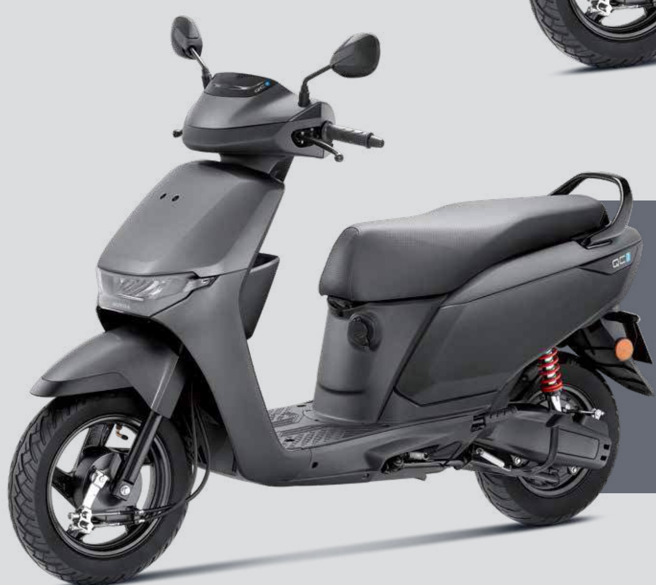
Matt Foggy Silver Metallic

*Products shown in the pictures may vary from actual products available in the market. All features and colours may not be a part of all variants. Accessories shown in the pictures are not a part of standard equipment. For creative visualisation only.