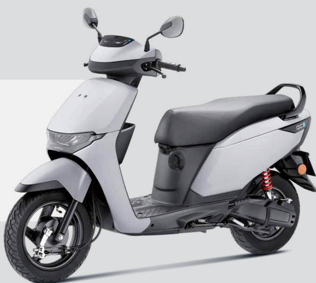
Pearl Misty White