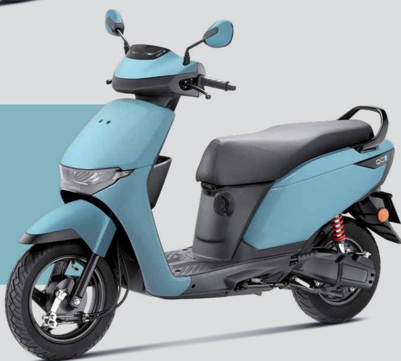
Pearl Shallow Blue