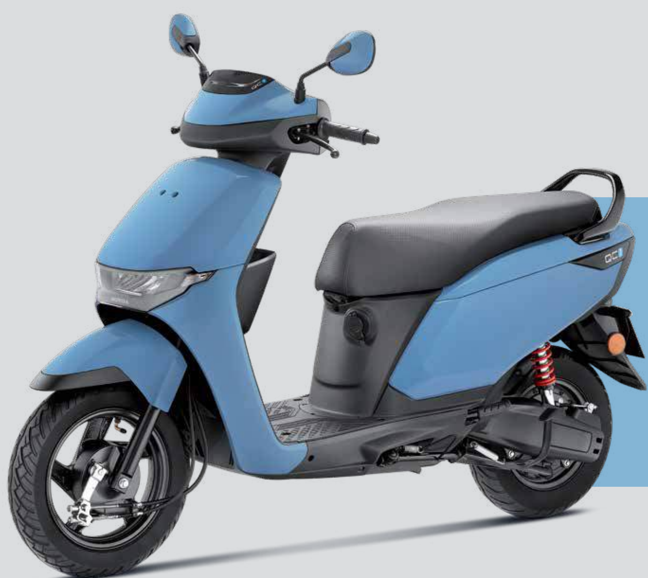
Pearl Serenity Blue

Choose from a range of stunning colours that reflect your personality.